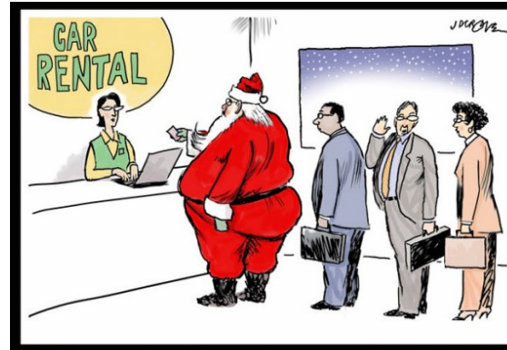
"THE EPA IS GETTING ON HIM FOR HIS REINDEER EMISSIONS!"

M ER RYC HRIST MASHA PYHANU KKAHSEAS ONGREETIN GS HAPPY KW ANZAABLESSED YULE HAPPY HOLI DAYS